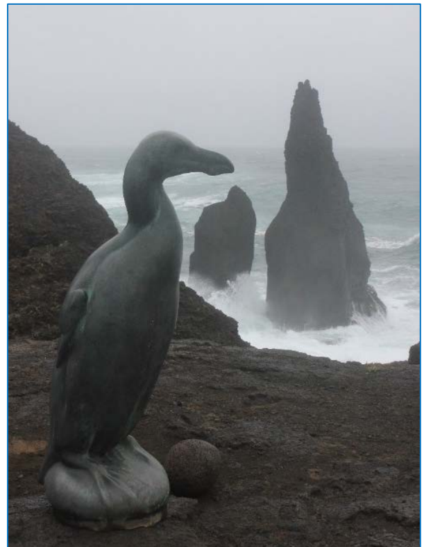
The outer tip of the Reykjanes peninsula demonstrating active coastal processes as well as volcanic rocks linked to the active spreading zone belonging to the Mid-Atlantic ridge. In the foreground a monument of the extinct Great Auk ( Pinguinus impennis ) in its rightful habitat.

We visited hydrothermal areas, fissures and an excellent locality of pillow lava in an active stone quarry. It was, however, the outer tip of the peninsula, which gave the strongest impression. In strong wind along the rough coast, young eroding volcanoes were demonstrated together with the deposits linked to the eruption, found on land, and a dyke representing the spreading zone in an actively eroding cliff where the Reykjanes ridge comes ashore.