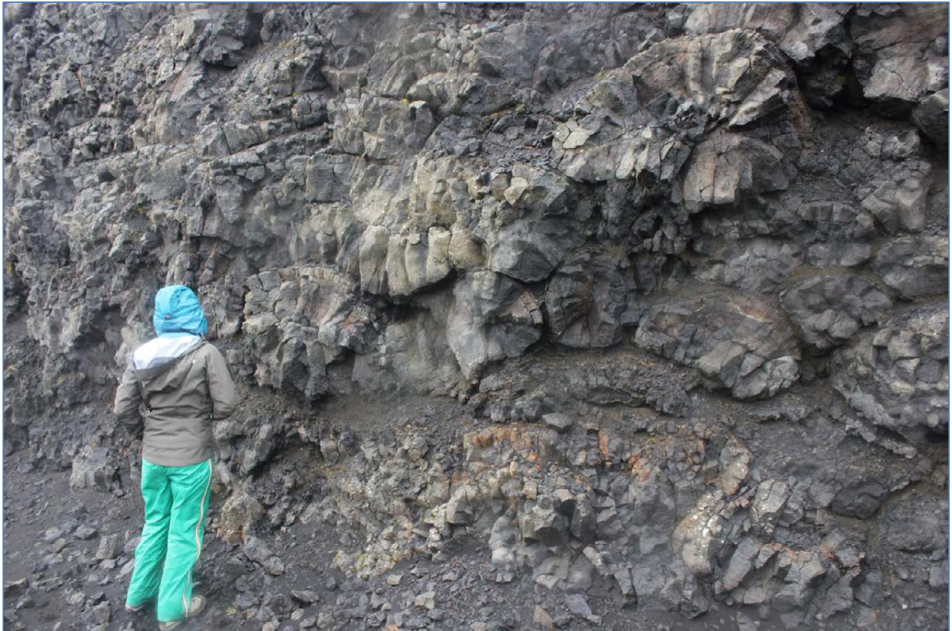
Pillow lava on the Reykjanes peninsula.