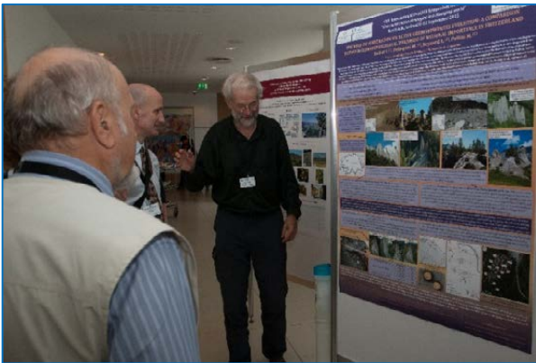
From the poster area.