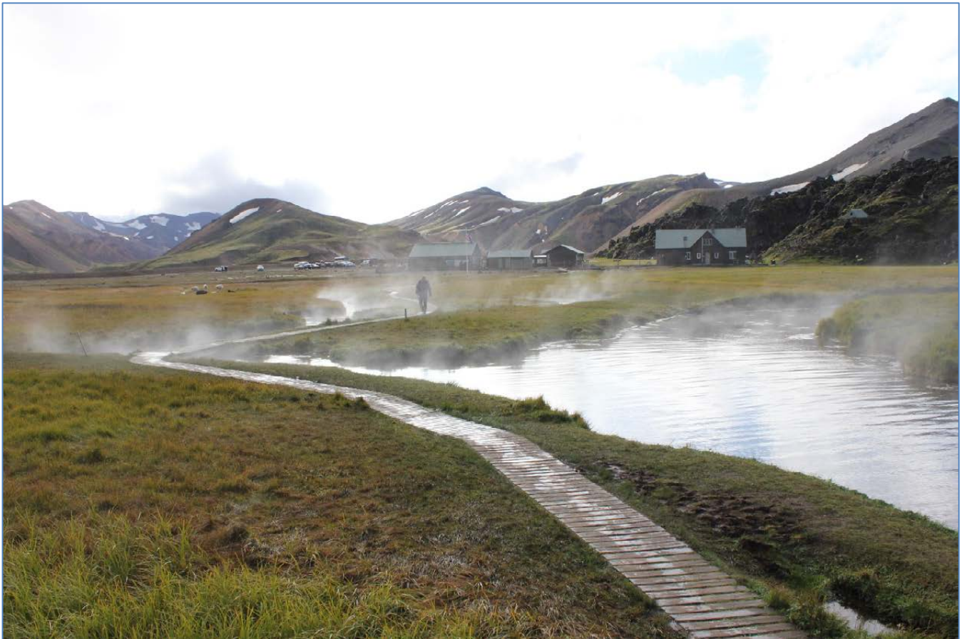
The Landmannalaugar hot spring area.