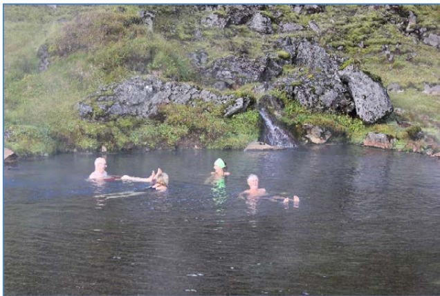
Relaxing in the Landmannalaugar pool.

The debate refers to how much development should be allowed and which areas should be developed and which areas are to be protected. This debate must get its input scientifically in a multidisciplinary setting combining geo- and biodiversity and work is going on with inventories and investigations to support the planning process.