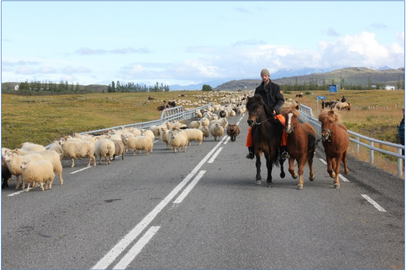
Sheep driven home after summer grazing season in the highlands.