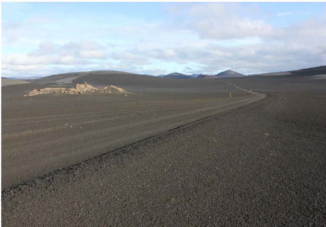
The interior has an overall pristine character even in places crossed by roads. The landscape is dominated by volcanic features and gives great geological and geomorphological impressions.