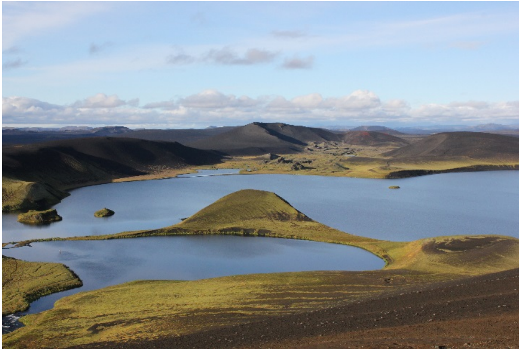
Veidivötn crater lakes and rows of craters is a landscape of extraordinary geodiversity and beauty. The crater lakes and wetlands add significantly to the biodiversity in the area.