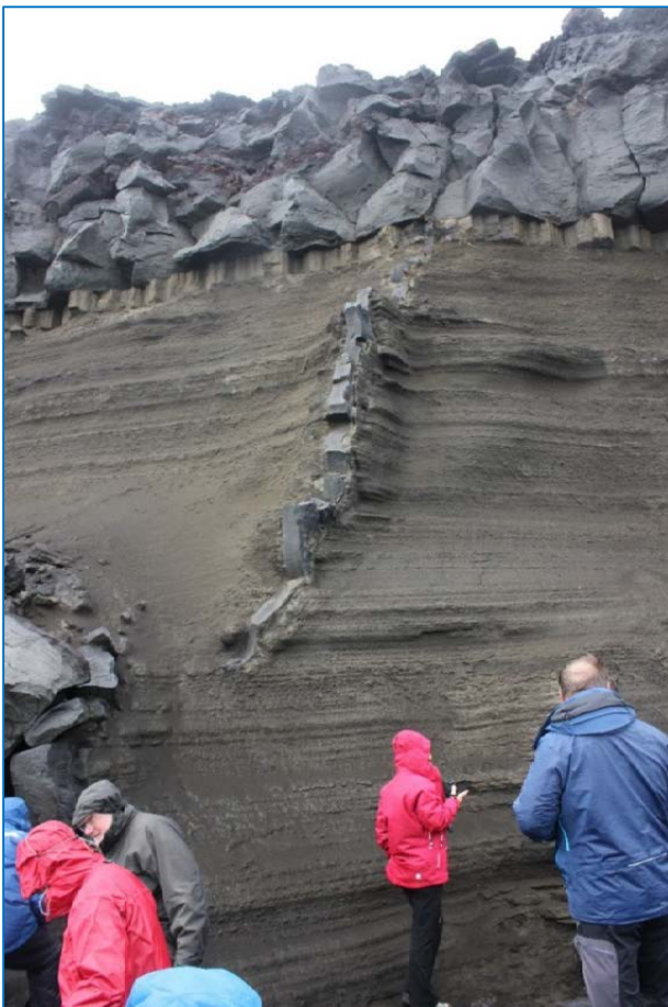
The Reykjanes ridge coming ashore.