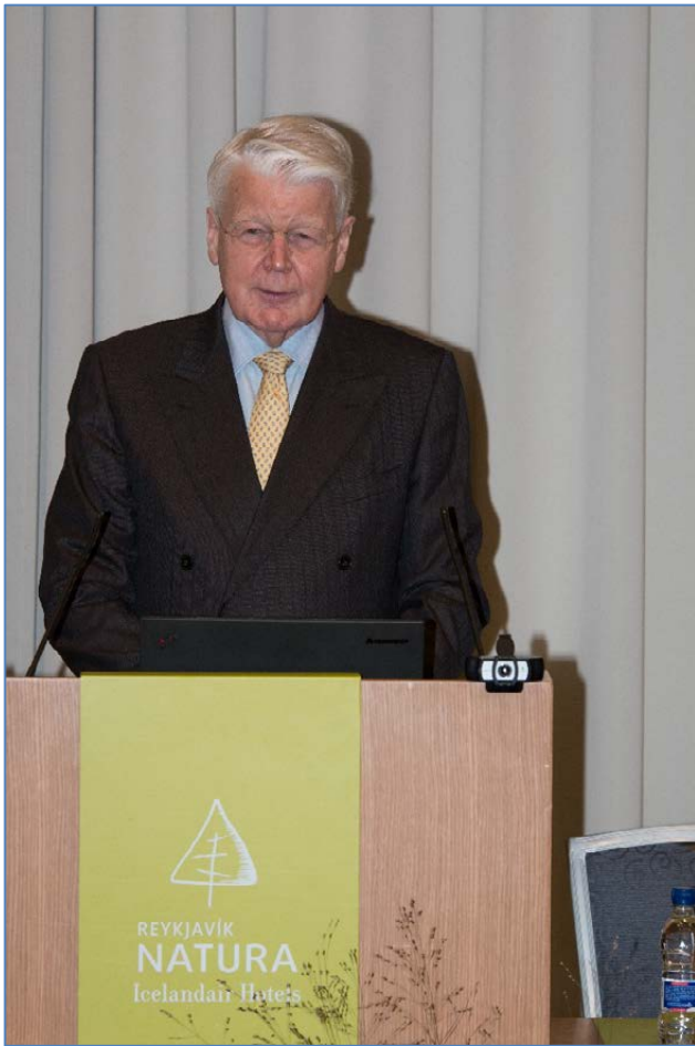
President of Iceland, Ólafur Ragnar Grímsson giving his address speech.

The president pointed out that man believes that he can control and govern nature but in fact nature outmaneuvers man and man depends on nature. This difference can be viewed as a barrier between science and people when we talk about our place in nature.